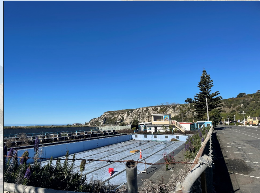
Figure 1: The former Lion's pool damaged by the 2016 Earthquake, remains unrepaired and unused in 2024.